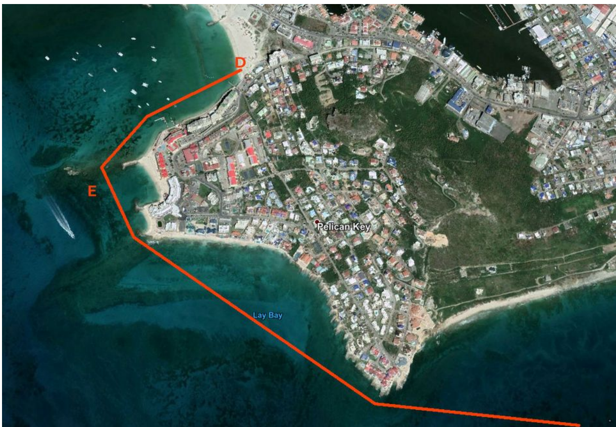
The finish at Simpson Bay (Kim Sha Beach). Pass around the point, cross the reef at (E) if you wish and finish on the beach at (D).